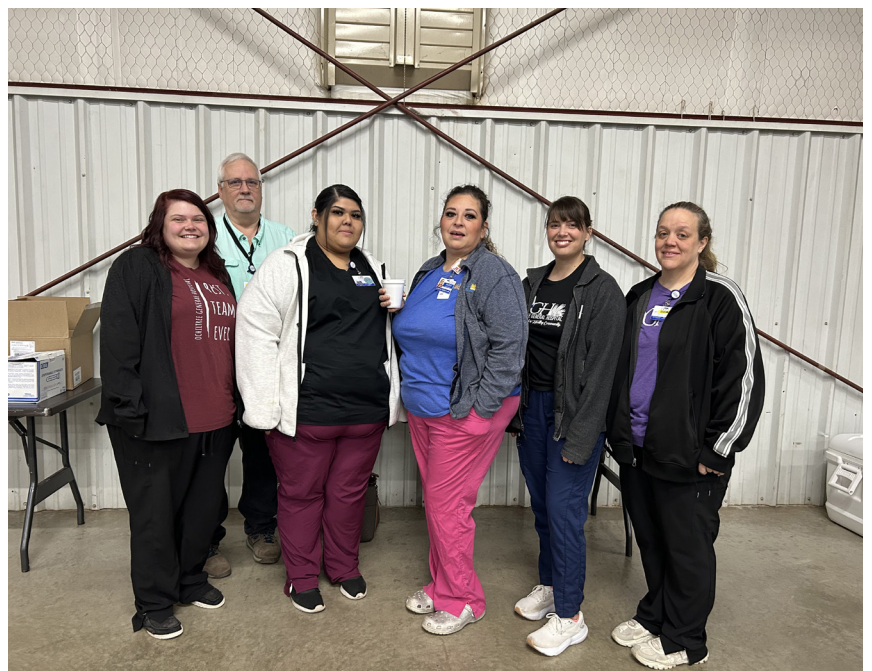
OGH Laboratory Team