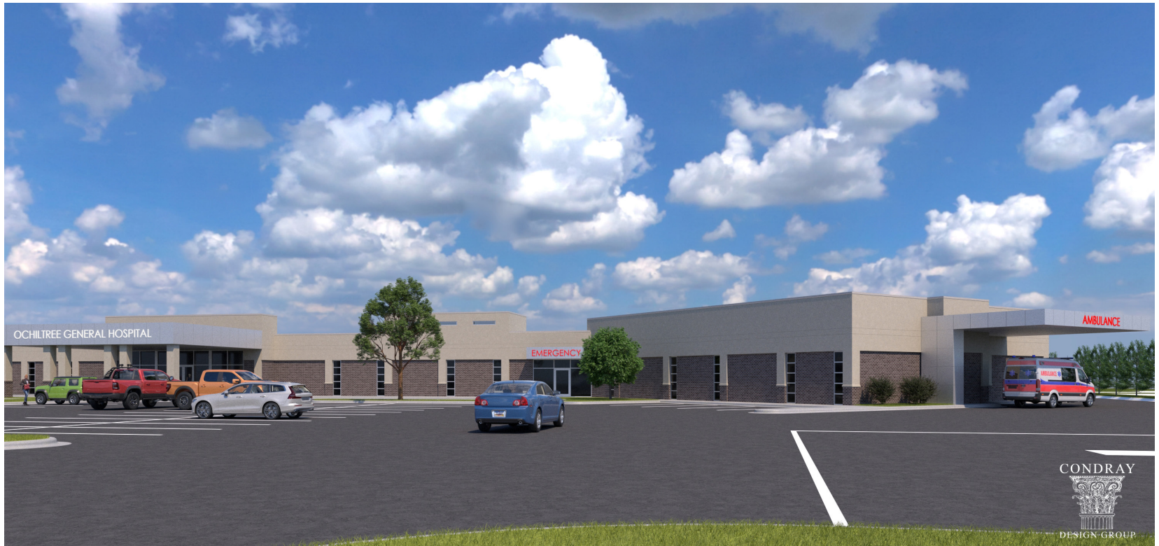
OGH EC Expansion Renderings by Condray Design Group, Inc.

Ochiltree General Hospital is embarking on a crucial project to build a new, state-of-the-art Emergency Room Services Wing. The current ER, built in 1966 and remodeled in 2007, is severely outdated and undersized, with only three treatment rooms and limited space, posing challenges to patient privacy and efficient care.