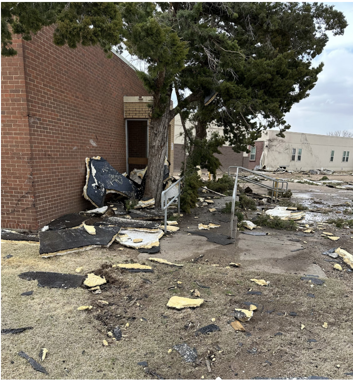
Behind the Hospital OB/Physical Therapy

The National Weather Service confirmed three small tornadoes touched down in Ochsiltree County. The tornado that affected the hospital was an EF0. The damage pales in comparison to the June 2023 tornado. We appreciate everyone who responded quickly to offer support or help clean up. OGH is repairing the damage, but recent rain has caused additional problems in the affected area. The hospital board approved a roof solution on Friday, April 5.