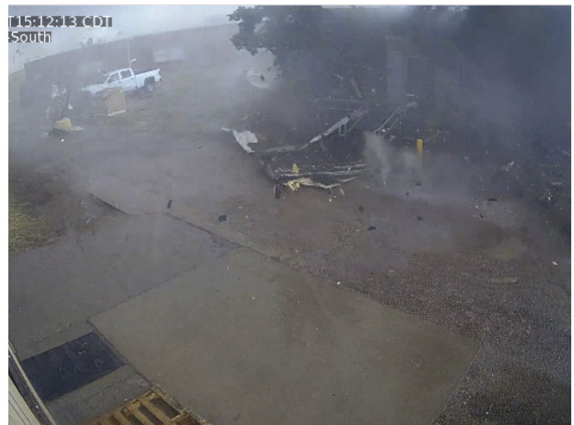
Snapshot from Security Camera