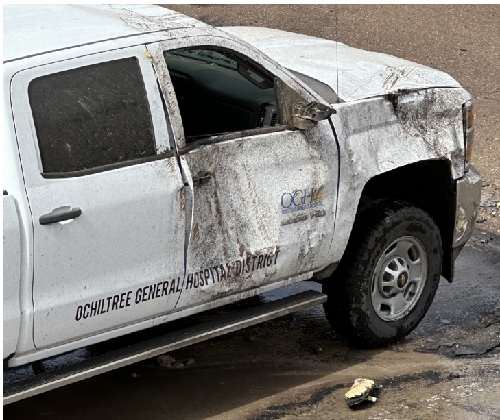
OGH Engineering Truck