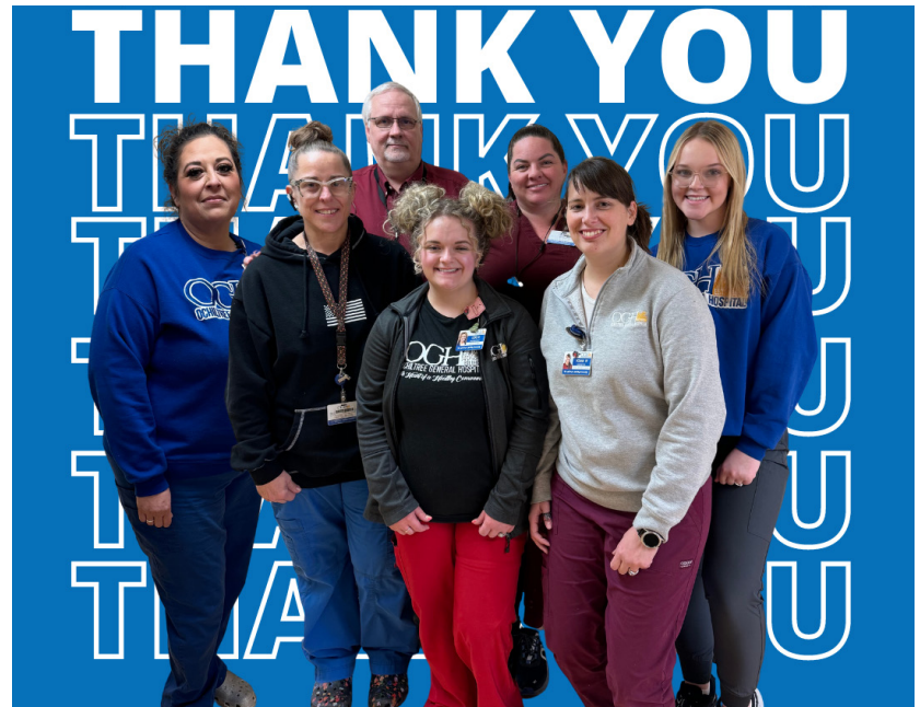
OGH Laboratory Team